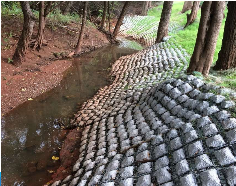
Both After photos