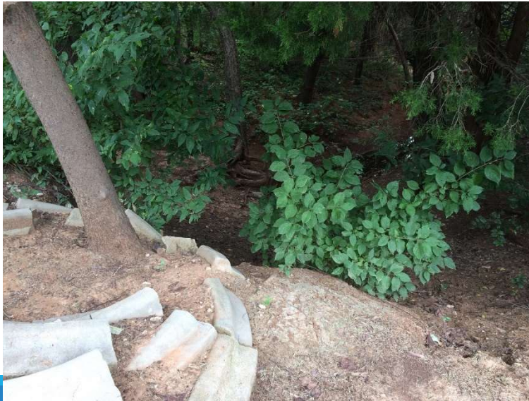
Both Before photos